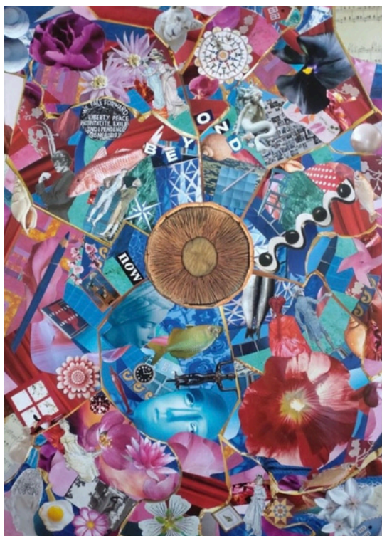
"Beyond" collage A2