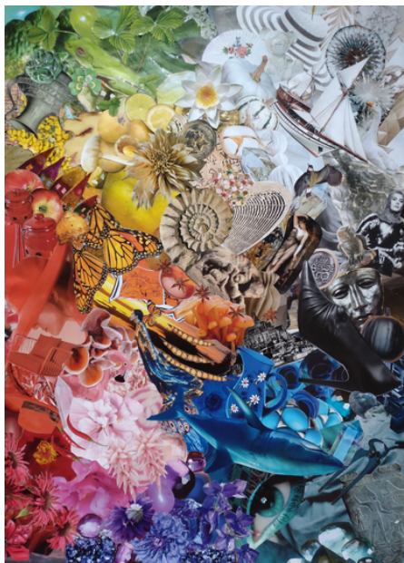
The Spiral 2 A(42 x 59,4 cm)