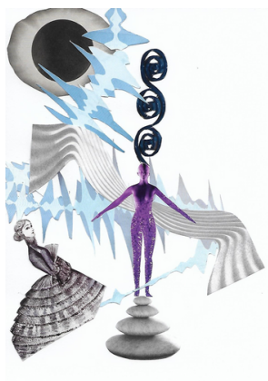
Miniatura 5 A5 (14,8 cm x 21 cm)