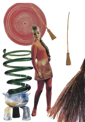
Miniatura 30 A5 (14,8 cm x 21 cm)