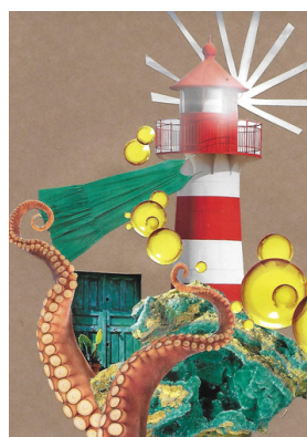
"Miniature" collage A5