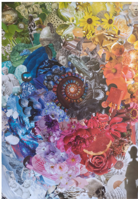
The Spiral 1 A2 (42 x 59,4 cm)