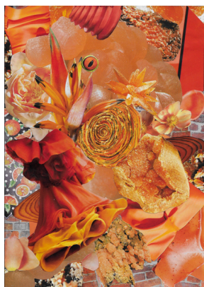
The orange spiral obsession A4 (21x29,7 cm)