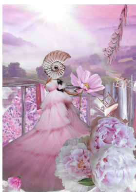
The pinkish spiral obsession A4 (21x29,7 cm)