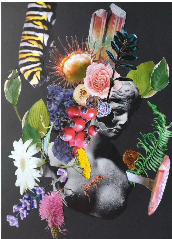
“Flora” collage A3