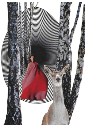
Miniatura 22 A5 (14,8 cm x 21 cm)