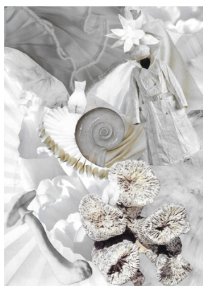
The white spiral obsession A4 (21x29,7 cm)