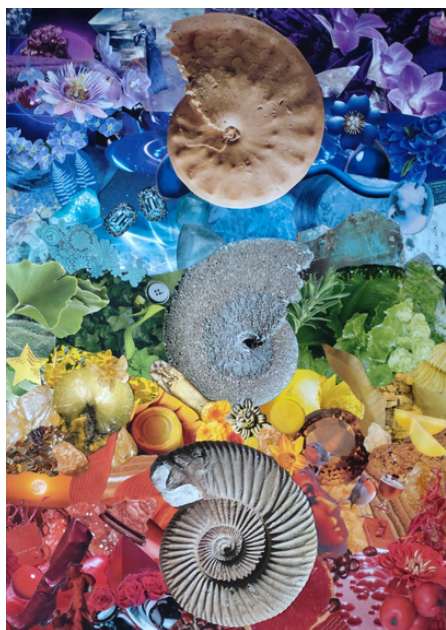
The Three Spirals A(42 x 59,4 cm)