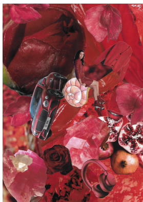
The red spiral obsession A4 (21x29,7 cm)