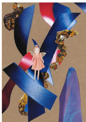
"Miniature" collage A5