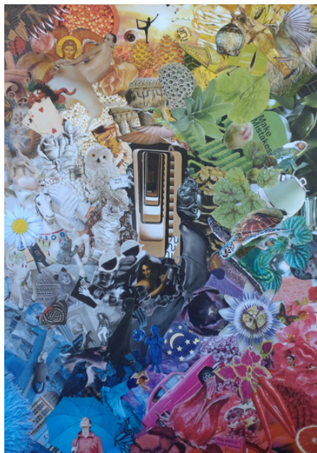
The Spiral 3 A2 (42 x 59,4 cm)