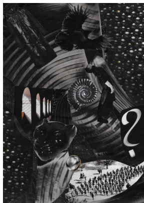
The black spiral obsession A4 (21x29,7 cm)